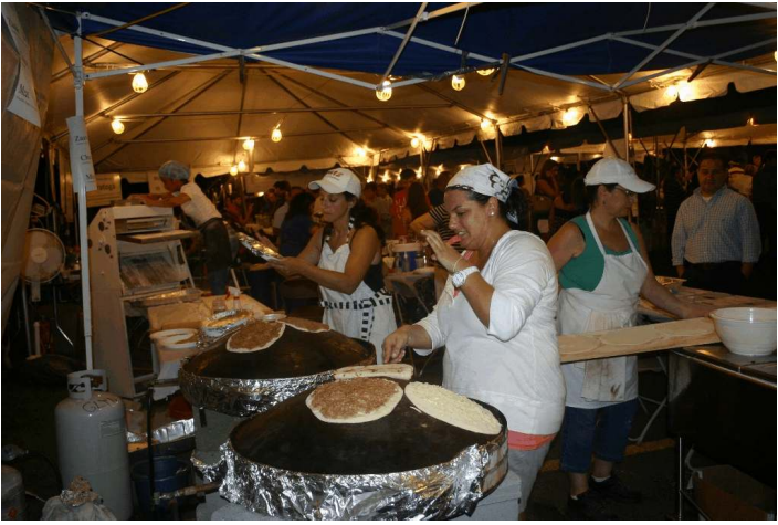
Members of St. Anthony Church in Danbury, Conn., make meat pies for their 8<sup>th</sup> annual Mahrajan .