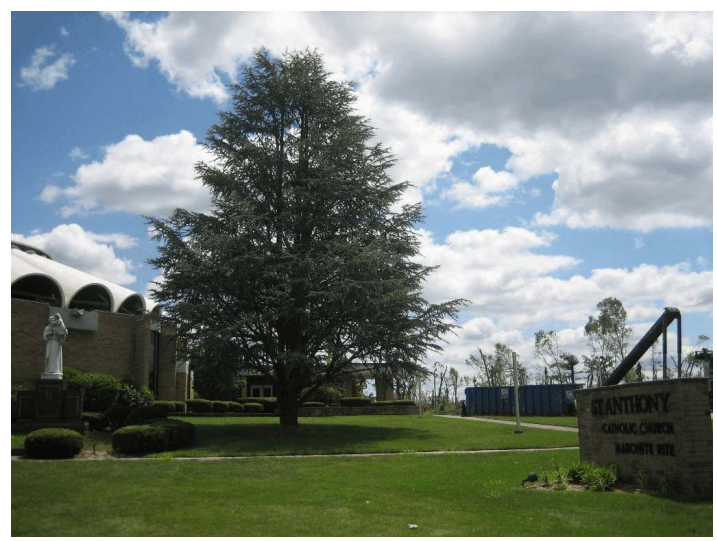
Entrance of St. Anthony Church in Springfield, Mass.