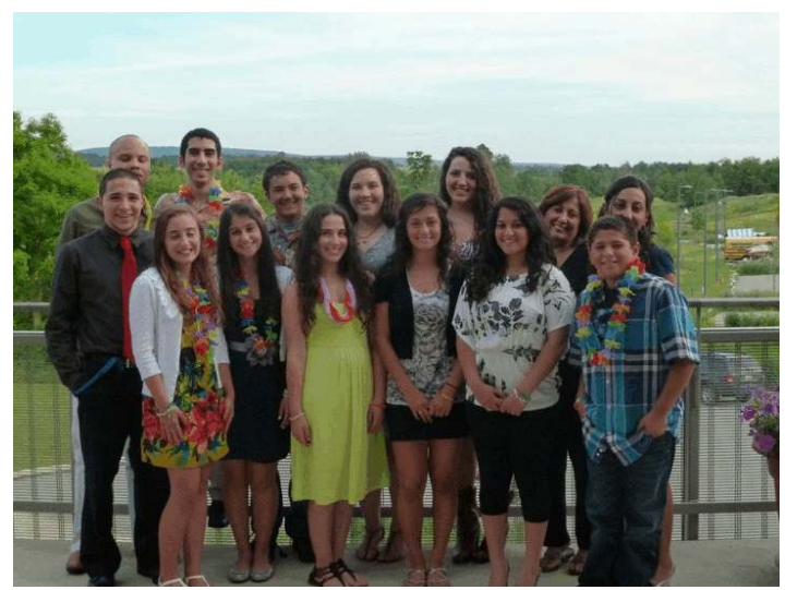
Youth from Our Lady's Church in Austin with their adult advisors at the Maronite youth retreat in Pennsylvania.