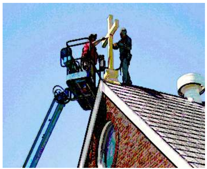
Painting of the Cross