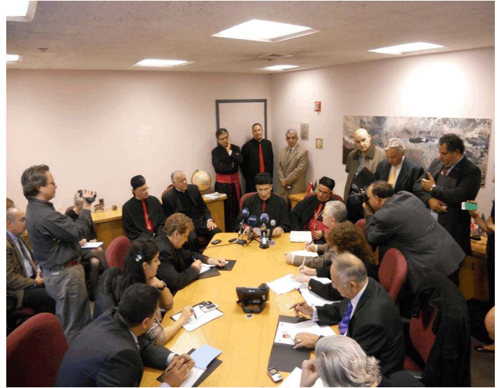
Patriarch Rai addresses the press at CNEWA.

and secular press. At the beginning of the press conference, Patriarch Rai read the following prepared statements: