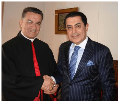
Patriarch Rai with Ambassador Nasser Abul Azziz Nasser, Head of the United Nations General Assembly.

In his remarks at the Luncheon, after voicing a stern warning against "shifting Arab Spring developments to an Autumn of Civil wars," Patriarch Rai hailed the role UNIFIL plays in preserving Lebanon's borderline stability.