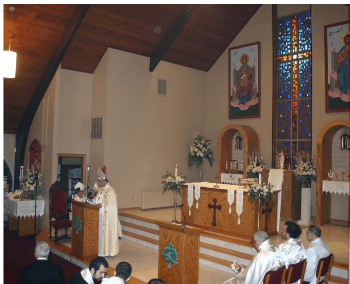
His Beatitude Patriarch Rai celebrates the Divine Liturgy at St. George Church in Uniontown, Penn., on October 17.