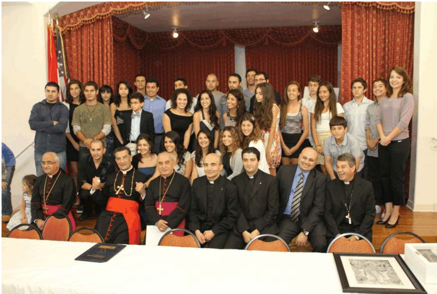
Patriarch Rai meets with the youth of Our Lady of Mt. Lebanon Cathedral in Los Angeles, Calif.