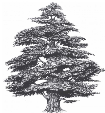
The Cedar of Lebanon

Immediately following the meeting, the Patriarch and his delegation paid a visit to the Lebanese Permanent Mission to the United Nations where he met with Ambassador Nawaf Salam and his staff. Patriarch Rai and his delegation also visited the Residence of the Permanent Observer of the Holy See to the United Nations where many ambassadors and diplomats were present. □