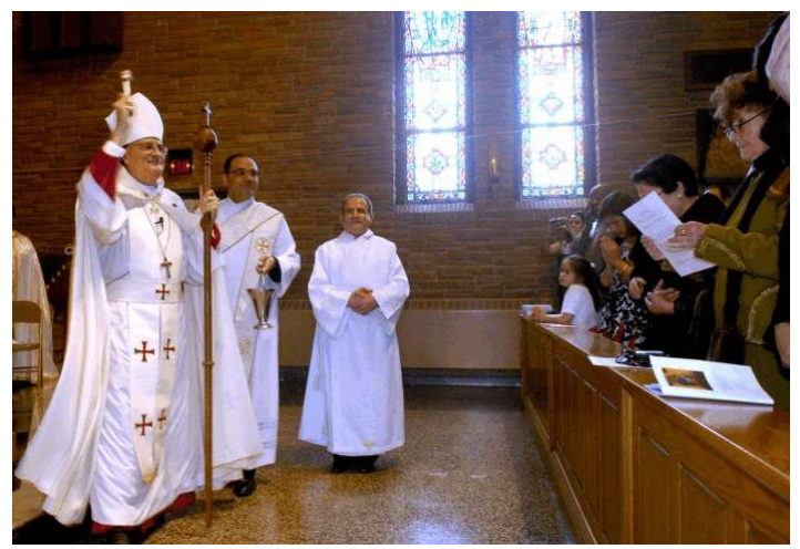
His Excellency Bishop Gregory Mansour sprinkles holy water to bless the newly dedicated Our Lady Star of the East Church in Pleasantville, N.J.