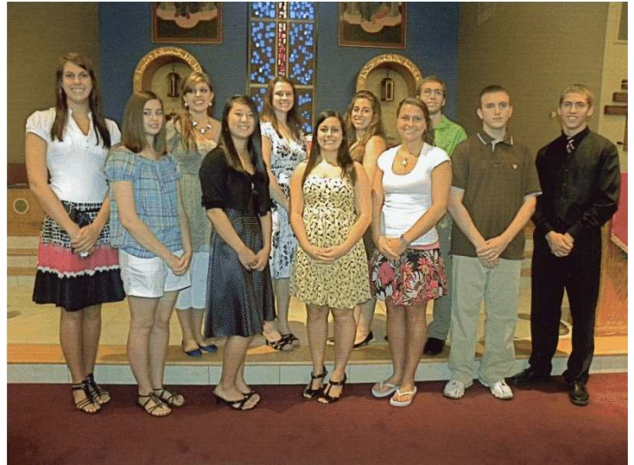
Class of 2010 of St. George Maronite Church in Uniontown, Penn.