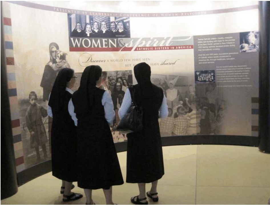
Antonine Sisters at the Exhibit.