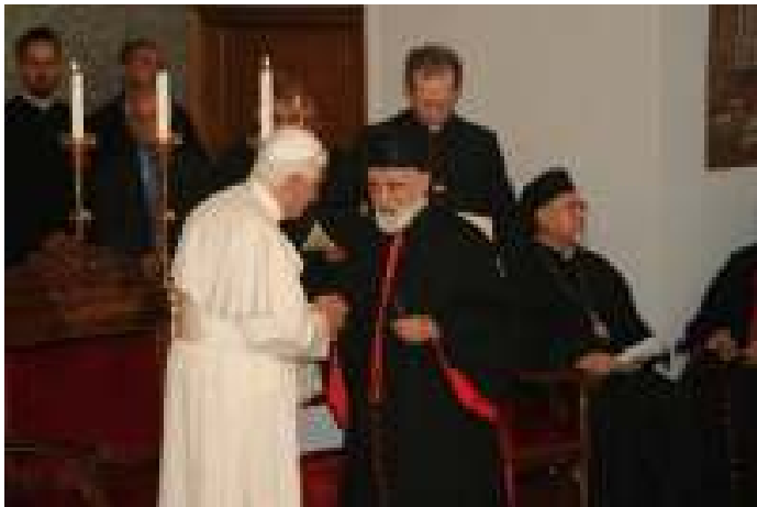
Patriarch Sfeir greets the Holy Father at Our Lady of Grace Maronite Cathedral in Larnaca, Cyprus.

Following the Holy Father's words, His Beatitude Nasrallah Peter Cardinal Sfeir, Patriarch of Antioch of the Maronites, prayed the prayer of forgiveness in the Syriac rite, followed by a hymn of invocation to the Virgin. Pope Benedict XVI traveled by car to the airport at Larnaca. □