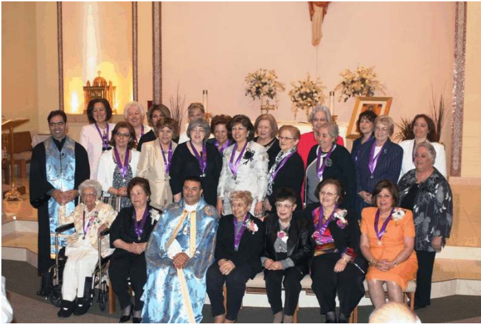
Members of the Altar Society - St. Anne's Club at St. Maron Church in Minneapolis, Minn.