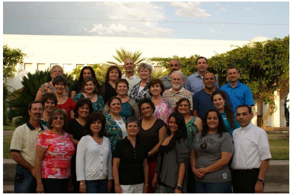
The 49<sup>th</sup> Annual Maronite Convention Committee.