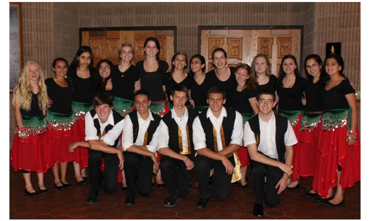
The dance troupe of St. Elias Church, Roanoke, Va.

Pleasantville, New Jersey First Annual Mediterranean Festival