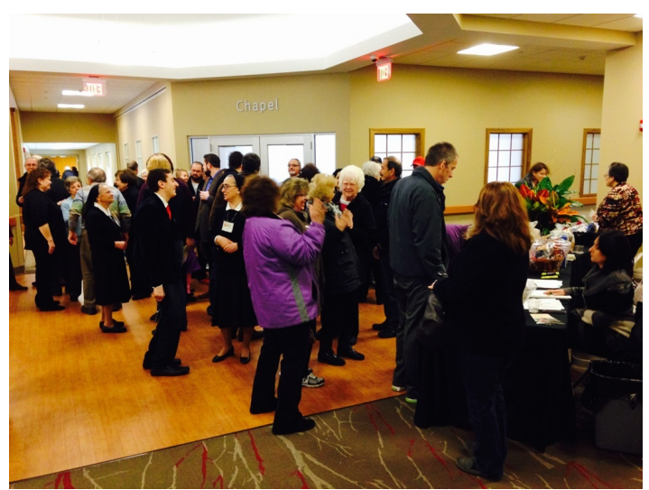
Antonine Village open house.

n Sunday, January 18, 2015, more than five hundred people attended an Open House for the new Antonine Village in North Jackson, Ohio. A ministry of the Maronite Antonine Sisters of Youngstown, Antonine Village provides assisted living and memory care for the elderly, especially those with Alzheimer's or other forms of dementia.