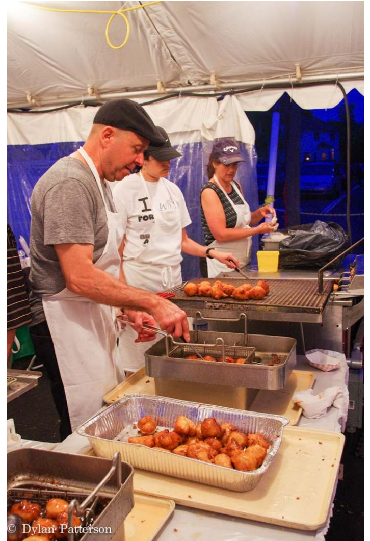
Zalabia is made fresh every day at the festival.