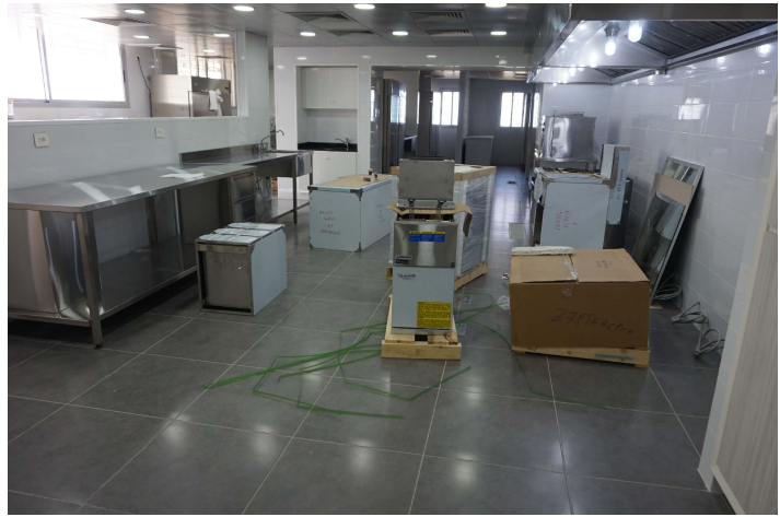
The new school kitchen awaits equipment, appliances and accessories.