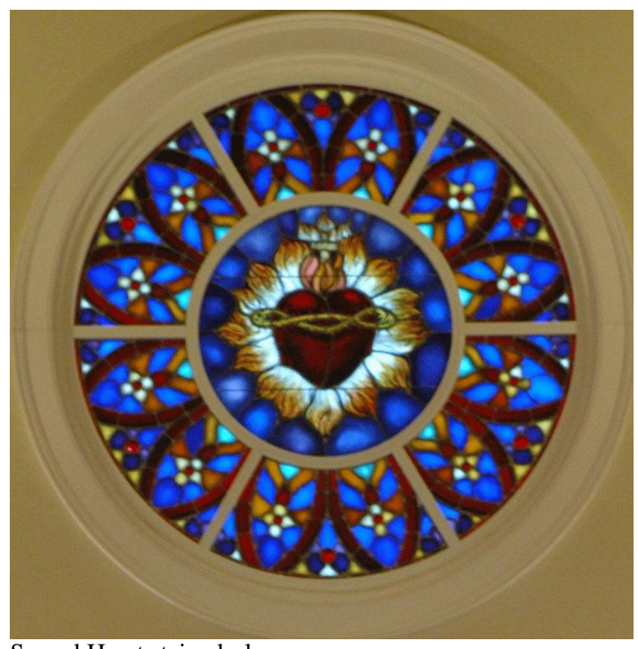
Sacred Heart stained-glass.