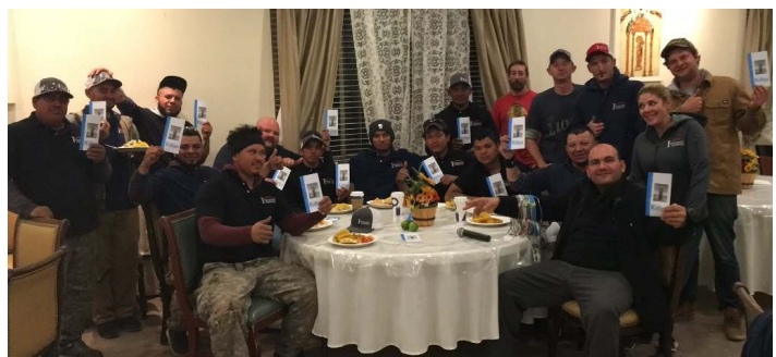
Volunteers at St. Rafka Church.

s we entered into the New Liturgical Year and began the preparation for the Glorious Birth of Our Lord, the weeks have been filled with many blessings at St. Rafka Church in Lakewood, Colo.