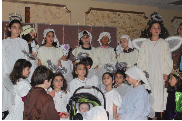
Cast members of the Christmas Pageant at Our Lady of Lebanon Church in Washington, D.C.