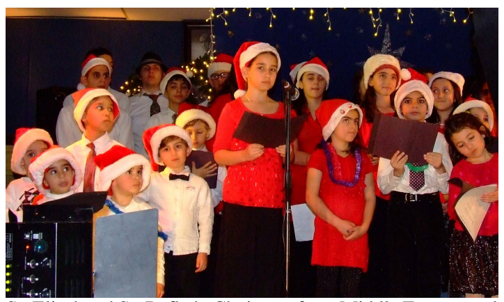
St. Elias' and St. Rafka's Choirs perform Middle Eastern and Western Christmas Carols.