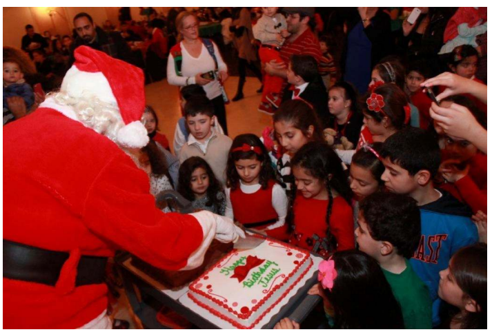
Santa Claus cuts a cake while children from St. Sharbel Church in Warren, Mich., watch.

aint Sharbel parishioners in Warren, Mich., braved the first winter storm of the season to celebrate the birth of Jesus at the Children's Annual Christmas Party. One would expect a low turnout in such inclement weather, but over 350 people could not be stopped by the snow on December 15, 2013! St. Sharbel families enjoyed food, carols, and Christmas stories together. And no Christmas party is complete without a visit from Santa! As children waited in excitement to tell Santa what toys they wanted, he turned their focus to the true gift that our Heavenly Father