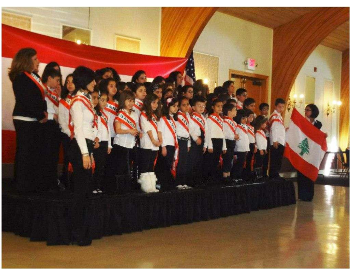
Children of St. Sharbel Maronite Church in Warren, Mich., sing the Lebanese National Anthem in remembrance of Lebanon's Independence Day.