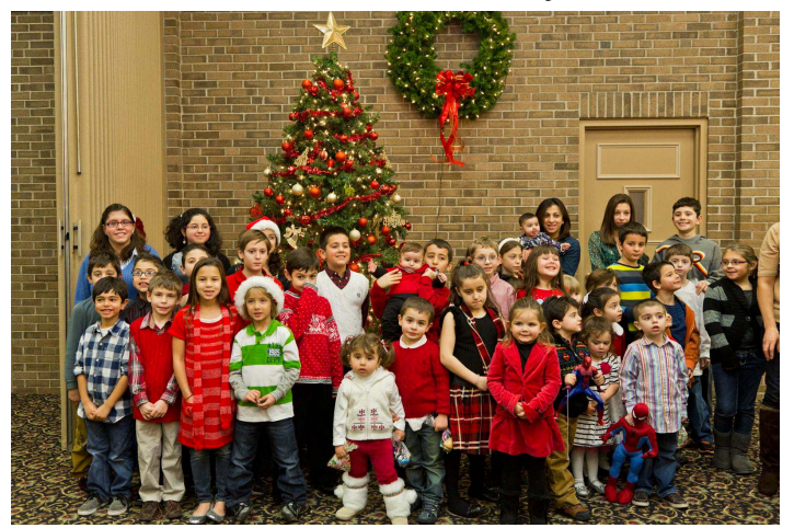
Children of Saint Anthony Maronite Church gathered around the Christmas tree in The Cedars Hall.