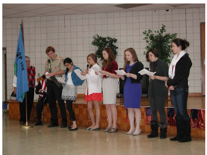
High school students of St. Elias Parish narrate the story of the Star Spangled Banner.

Veterans' Day, November 11, 2012, was on a Sunday this year, providing a perfect opportunity for St. Elias Parish, Roanoke, Virginia, to honor its veterans with a program and lunch following the Sunday Liturgy.