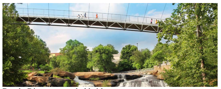
Reedy River suspended bridge.

The Peace Center for the Performing Arts contains a theater and concert hall as well as an outside stage for musical concerts and movie nights. This is just a taste of what Greenville has to offer its visitors.