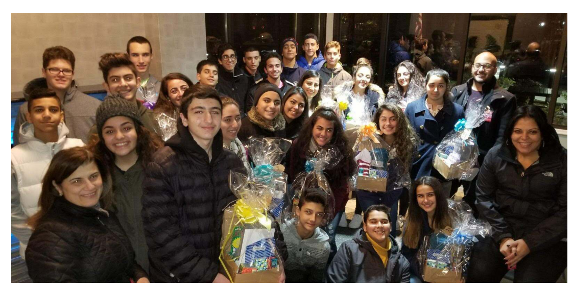
by St. Anthony's MYO

men, I say to you, whatever you did for one of these least brothers of mine, you did for me" (Mt $25:40). This Gospel verse was inscribed in the hearts and minds of the youth of St. Anthony Church in Lawrence, Mass., as they visited Mary Immaculate Nursing Home. On Sunday, November 12, 2017, close to thirty MYO members gathered to create care packages for the residents they were going to visit. Packing the boxes with socks, blankets, tea, Sudoku books and more, the members were very excited to deliver the packages. After a short walk to the nearby nursing home, the MYO split into three groups and each visited and spent time with residents, parishioners and non-parishioners alike. Statements from the residents like "What have I done to deserve this?" and "I know God sent you here for a reason" created spirits of faith, hope, and love throughout the facility. The members were so excited and thankful to be able to bring smiles to the faces of these residents and quickly started asking when they could come back and do it again. The MYO got to experience a new face of Christ that they may not have experienced before, one hidden behind joyful smiles and thankful tears.