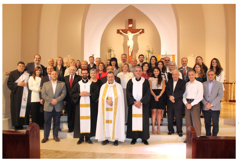
by The NAM Public Relations Committee

The NAM Board held its Fall meeting during the weekend of October 27 - 29, 2017, in Houston, Tex. The Board met on Friday evening with all committee chairs at Our Lady of the Cedars Church's Cedar Hall to get updated on the progress and the planned activities for the Maronite Convention to be held in July of 2018. It was a very fruitful meeting, as the Board members saw firsthand the excellent preparations and excitement of the committee chairs. The local chairs also had the chance to learn from the various Board members about their experiences in previous conventions